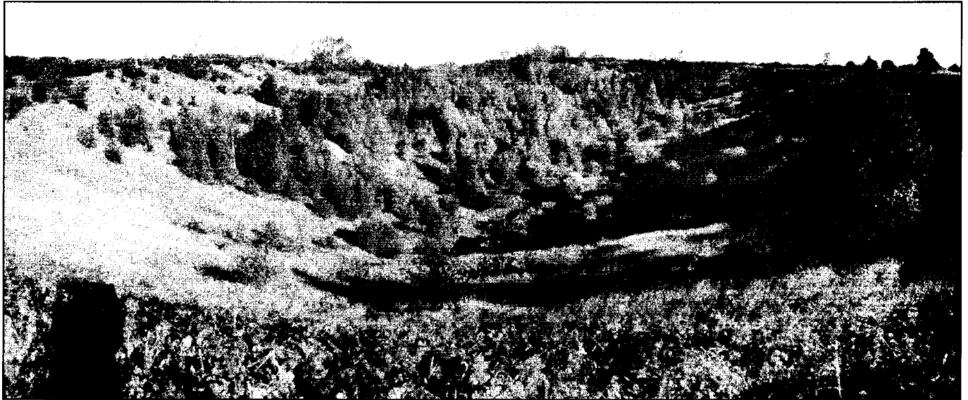
Figure 2. The explosion crater seen from its southern rim.

characterises the locally well-known alabaster from Chellaston. At Fauld, the best alabaster was found in lenses 5-12 m across, randomly distributed within the chalky gypsum.